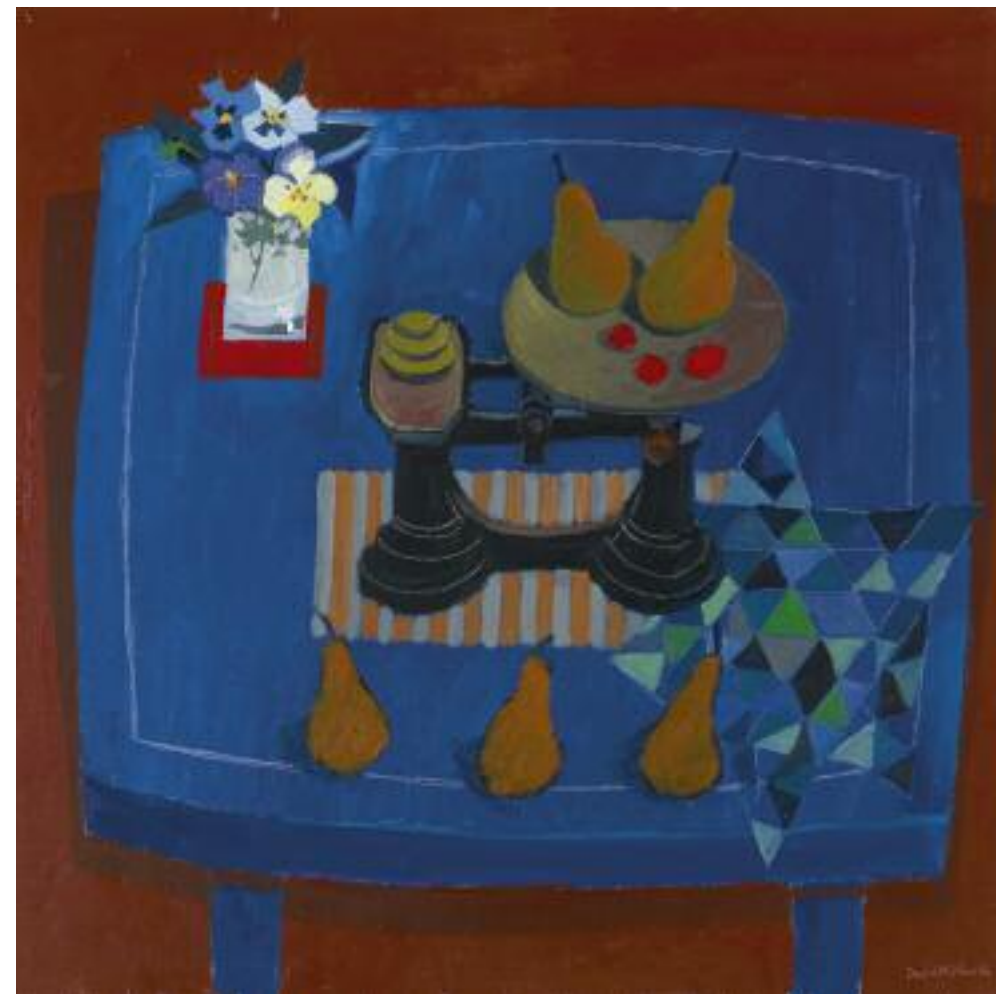
The Blue Table 29 x 29 ins 74 x 74 cms oil on canvas