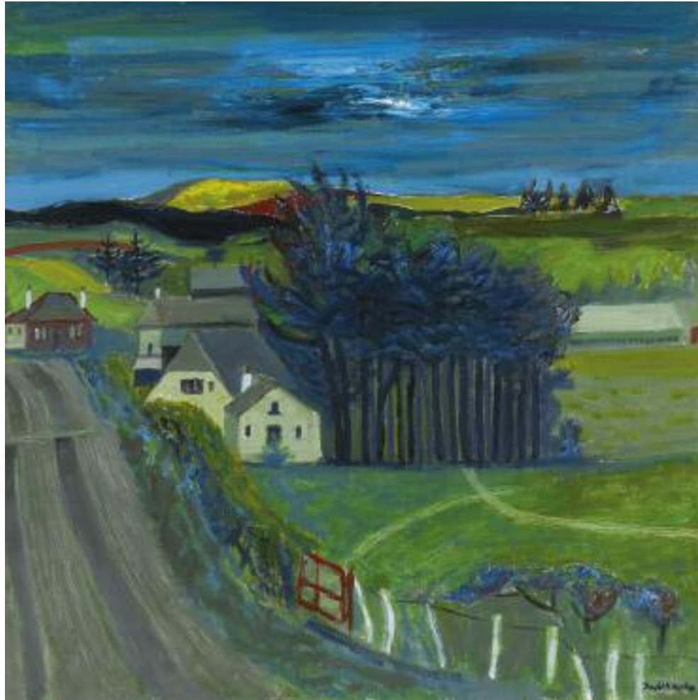
The South Road, Eaglesham 28 x 28 ins 71 x 71 cms oil on canvas