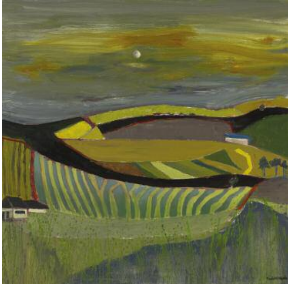
Field Pattern & Moon 29 x 29 ins 74 x 74 cms oil on canvas