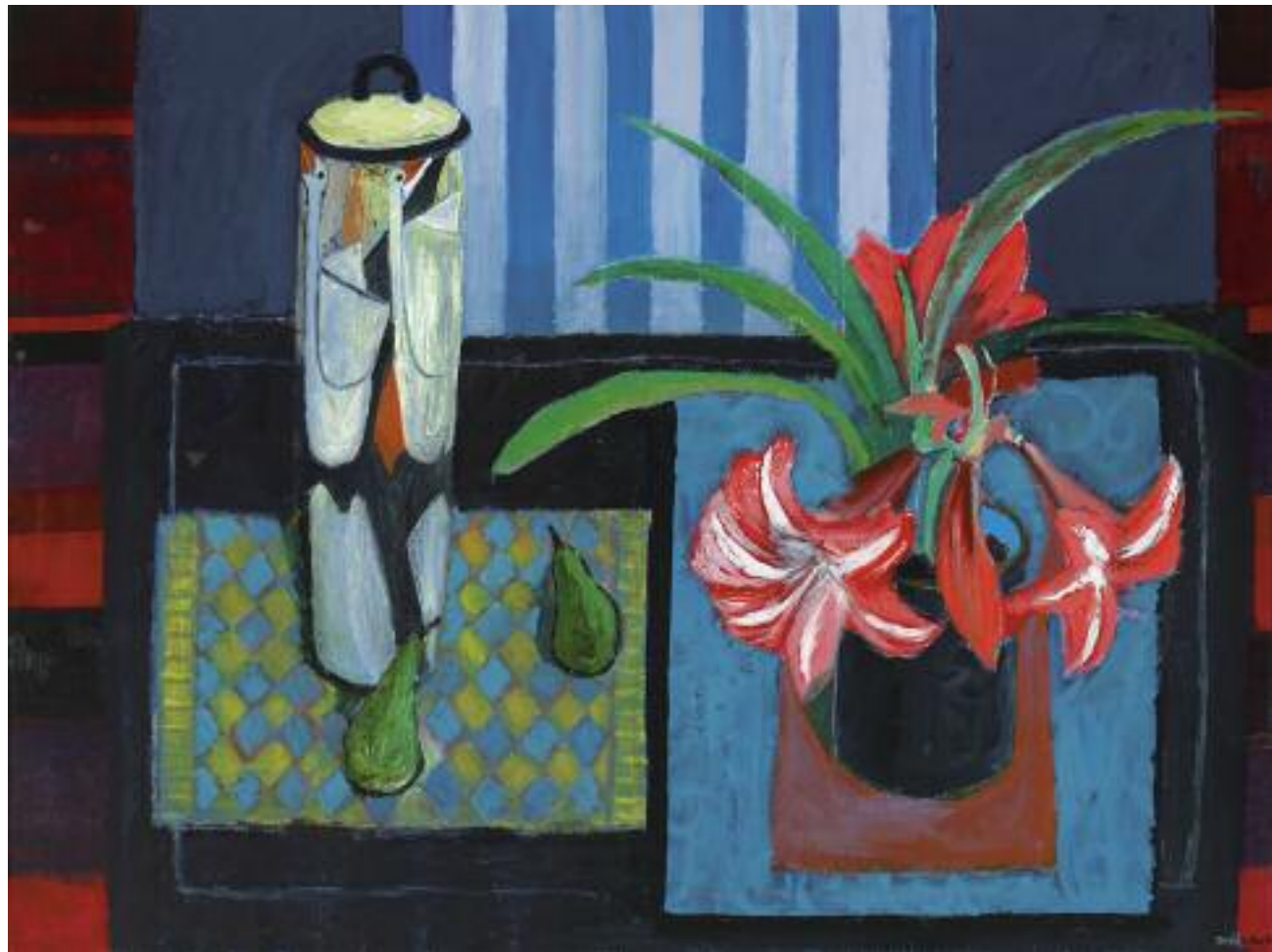
The Black Table 29 x 39 ins 74 x 99 cms oil on canvas