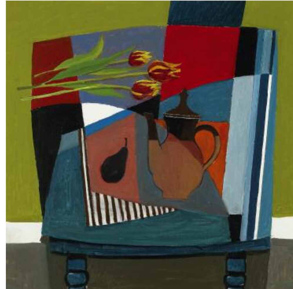
Three Tulips & a Coffee Pot 29 x 29 ins 74 x 74 cms oil on canvas