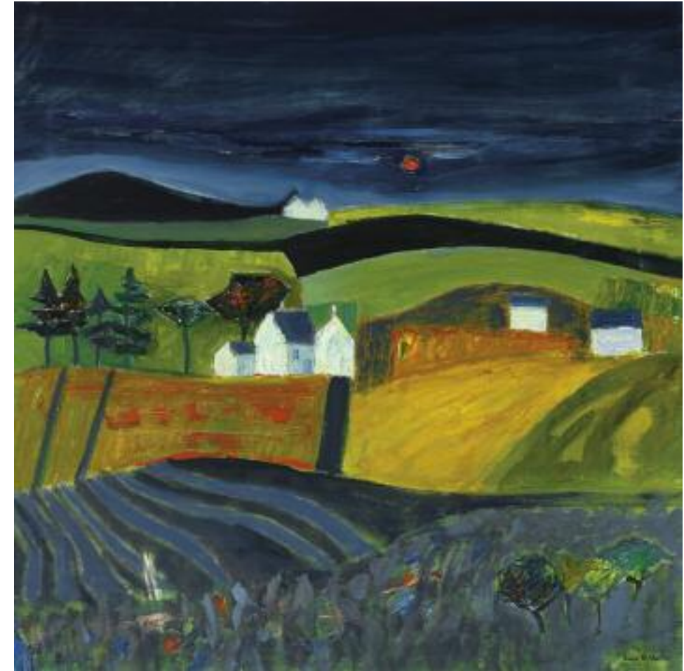
Evening Fields, Ayrshire 29¼ x 29¼ ins 74 x 74 cms oil on canvas