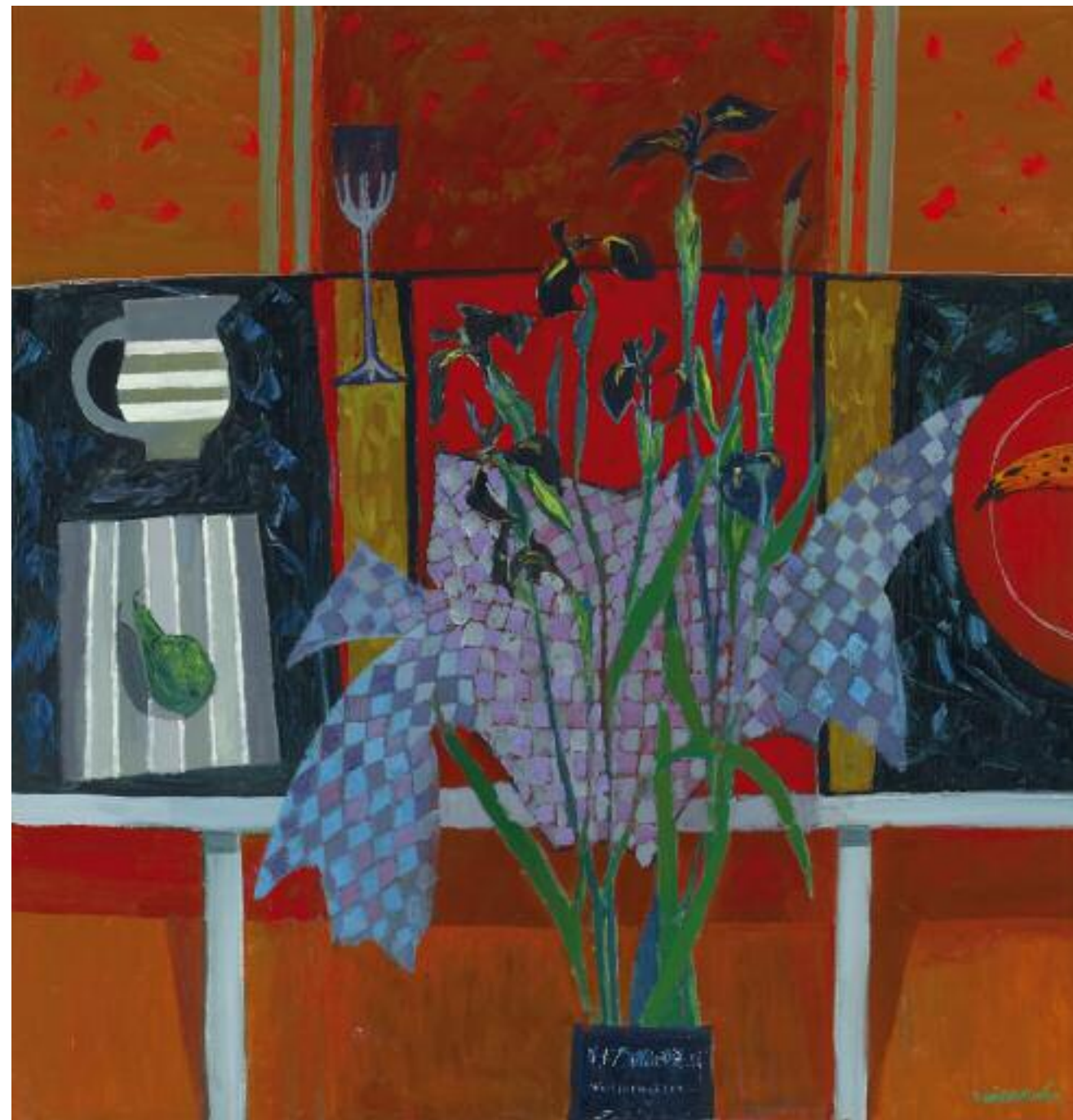
Irises & Chequered Cloth 39 x 39 ins 99 x 99 cms oil on canvas