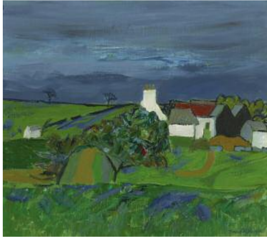
Near Fenwick 15 x 17½ ins 38 x 44.5 cms oil on canvas