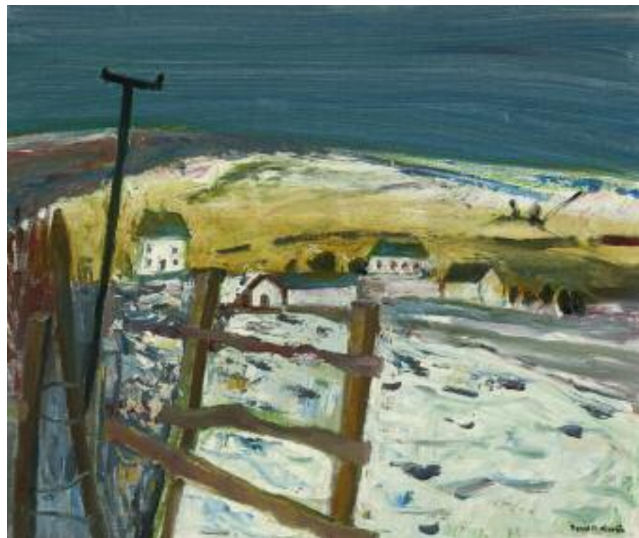
Hillside near Broughton 19 x 23 ins 48 x 58.5 cms oil on canvas