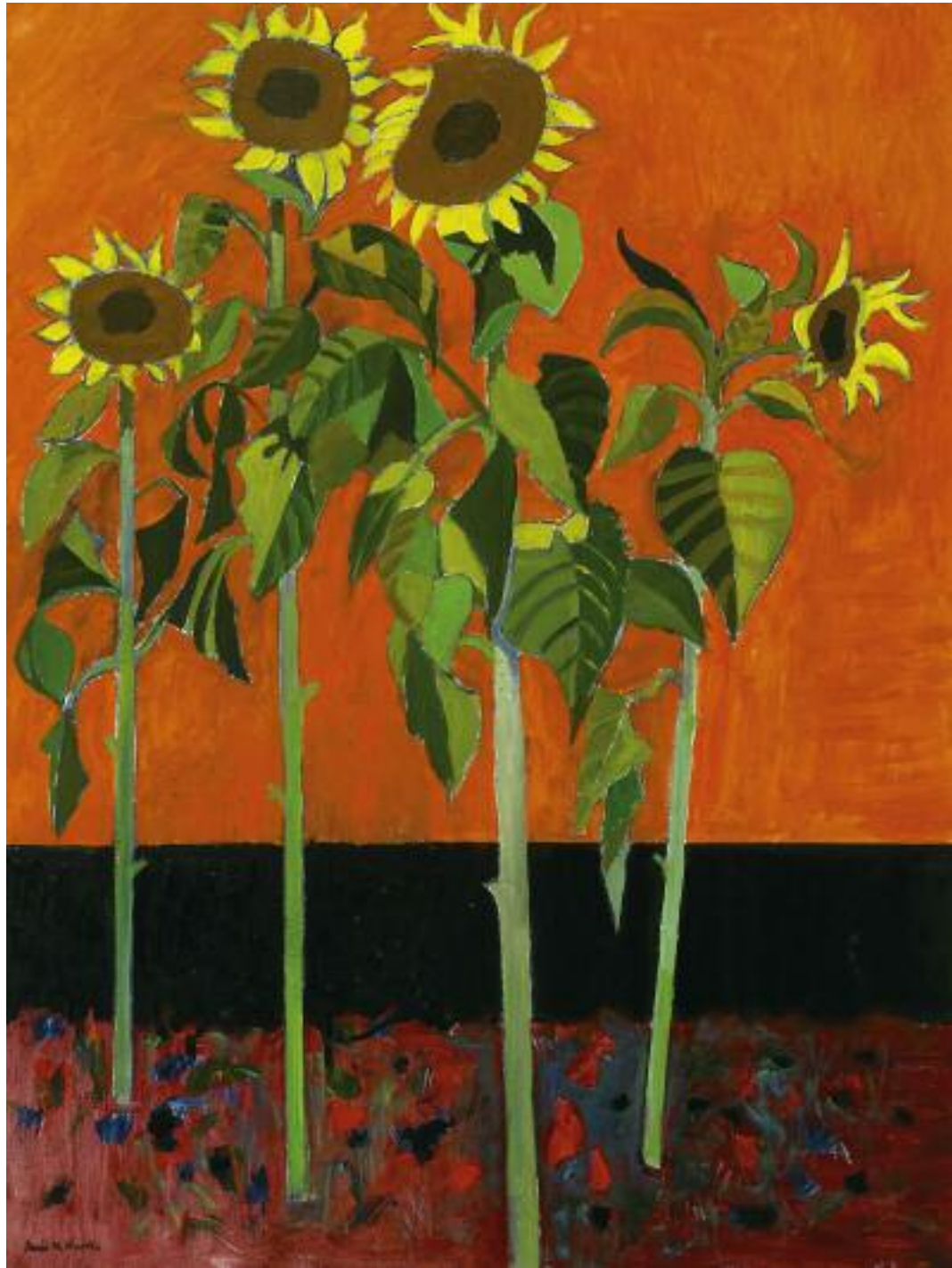
Sunflowers on an Orange Ground 39 x 29 ins 99 x 74 cms oil on canvas