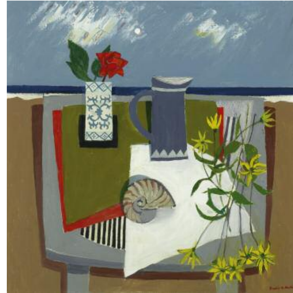
Table by the Sea 29 x 29 ins 74 x 74 cms oil on canvas