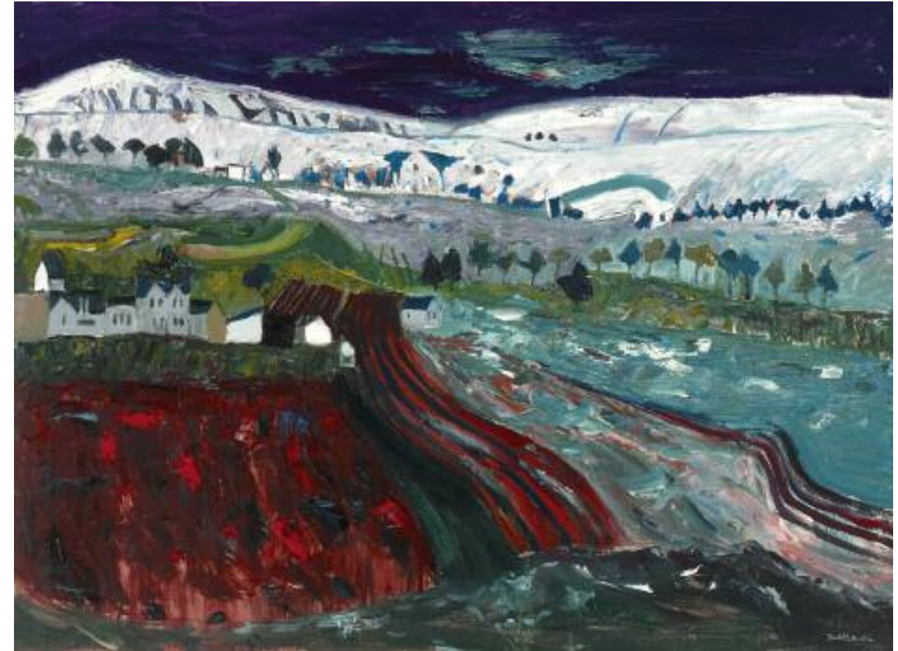
Winter Landscape, Ayrshire 29 x 39 ins 74 x 99 cms oil on canvas