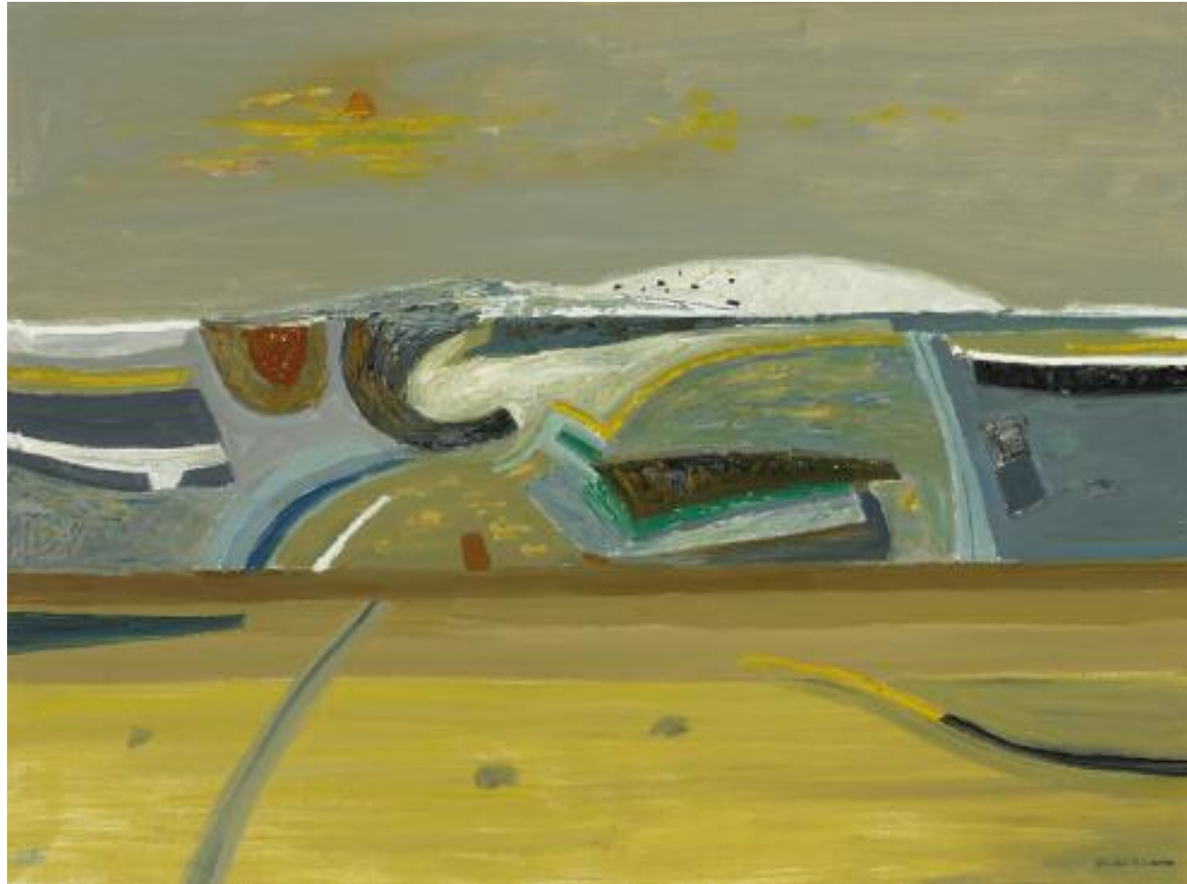
Thoughts on a Winter Landscape 29 x 39 ins 74 x 99 cms oil on canvas