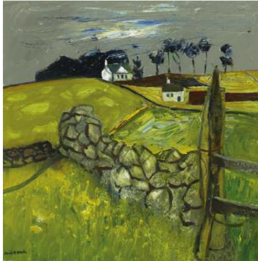
The House on the Rise 23 x 23 ins 58.5 x 58.5 cms oil on canvas