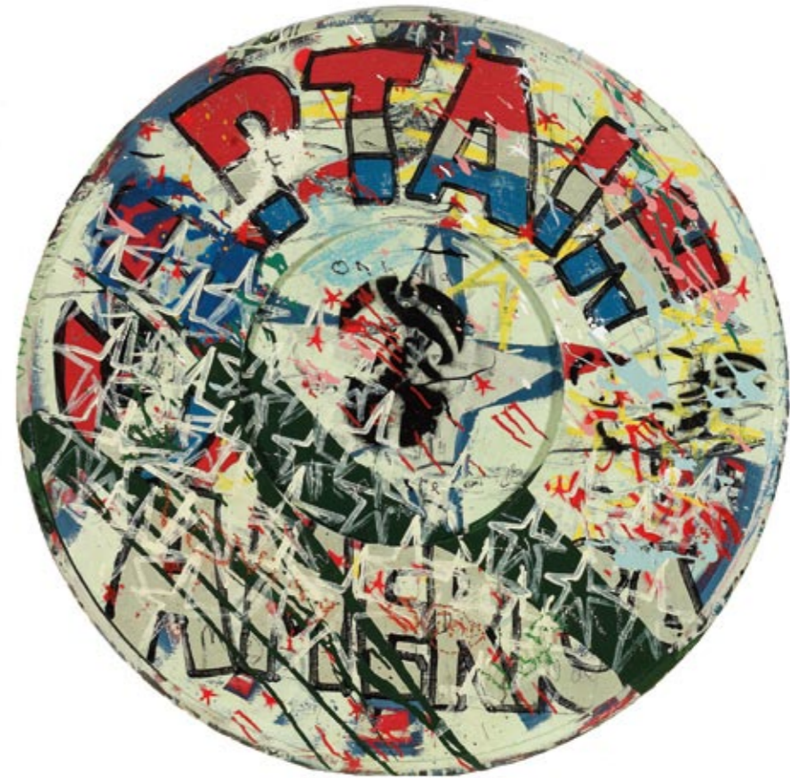
pacman we trust acrylic, oil, pastel and pencil on wood 108 cms, 42 ins diametre