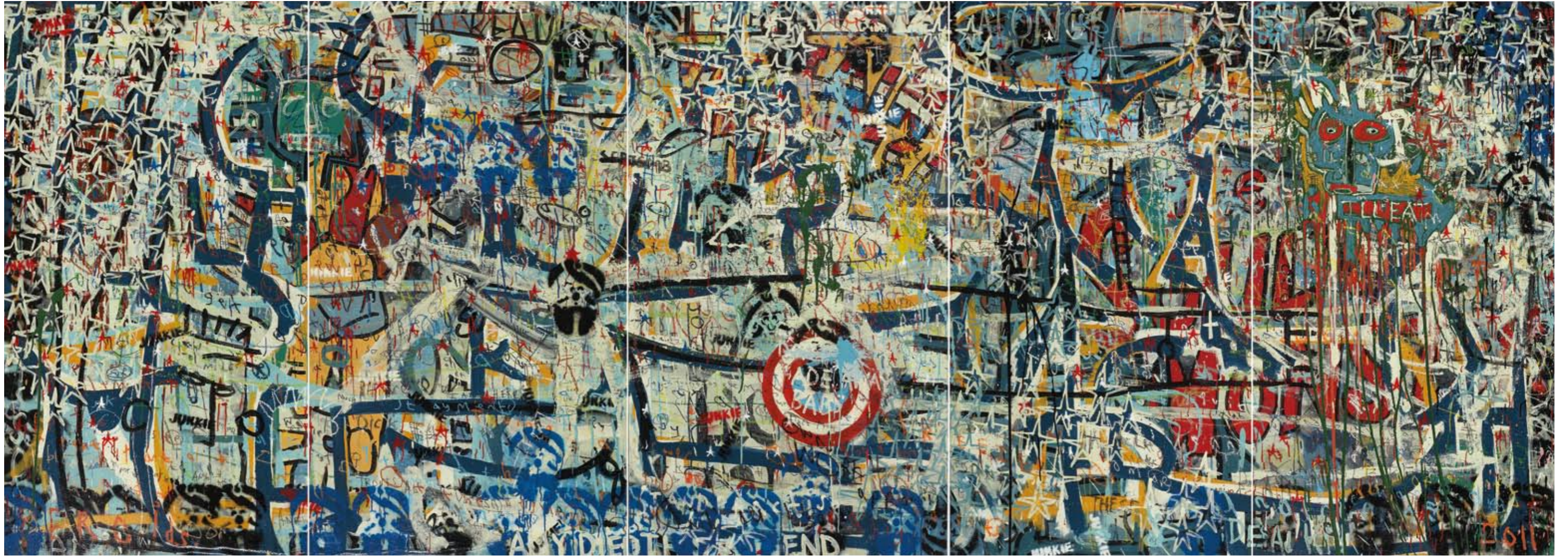
captain america vs the rest of the world, 2011 acrylic, oil, pastel and pencil on wood 175 x 490 cms, 69 x 192 ins