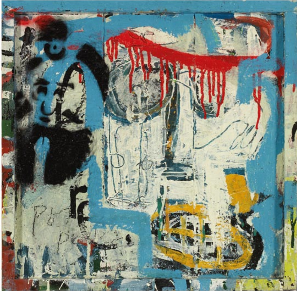
red band head, 2011 acrylic, oil, pastel and pencil on wood 47 x 47 cms, 18 x 18 ins