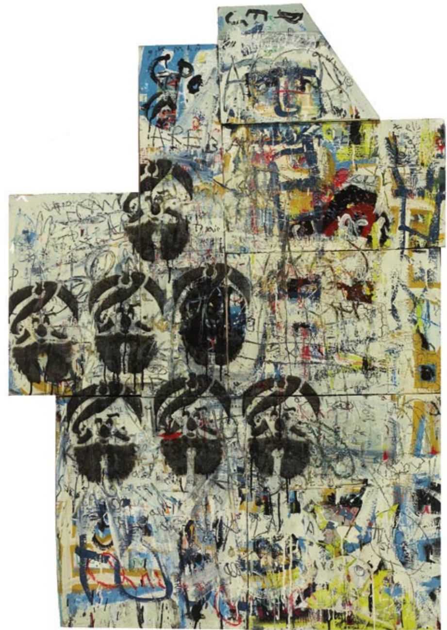
reverend hamster, 2010 acrylic, oil, pastel and pencil on wood 144 x 117 cms, 56 x 46 ins