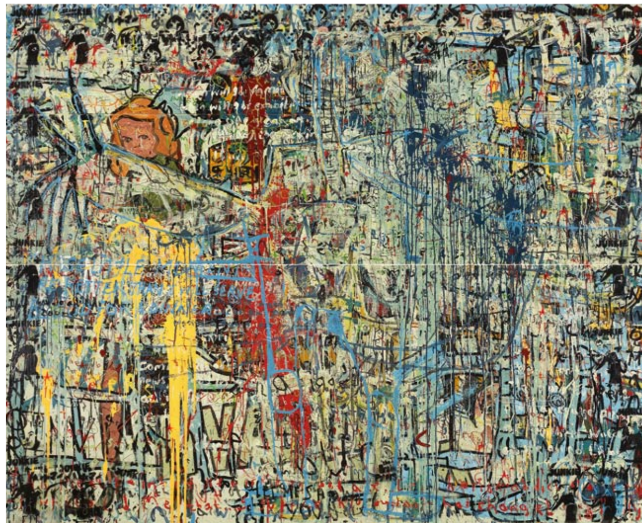
mama with a gun, 2011 acrylic, oil, pastel and pencil on wood 238 x 300 cms, 94 x 118 ins