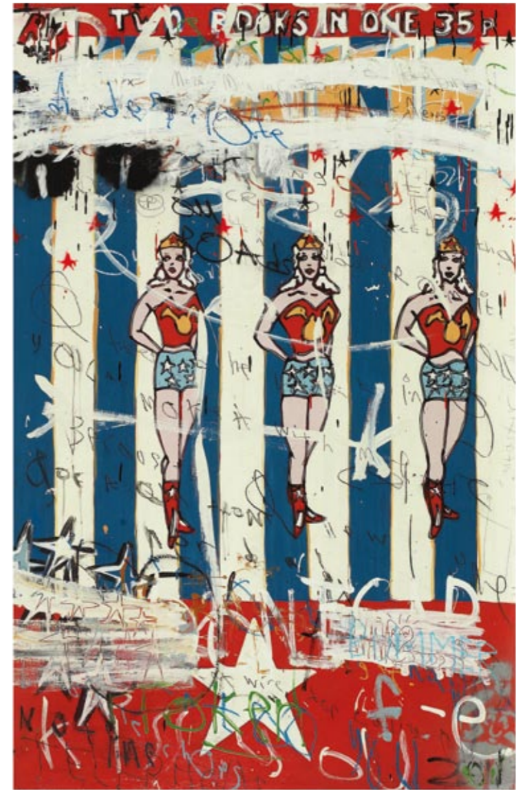
real plastic girl acrylic, oil, pastel and pencil on wood 168 x 107 cms, 66 x 42 ins